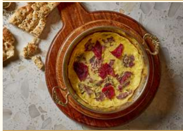
بیض بسطرمة - Omelette Pastrami Egg - butter - pastrami