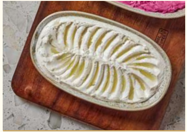
لينه تركي - Süzme