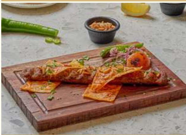
كفتة لحم بالصنوبر - Beyti Kebab

Meat Kofta Grilled with pine with Your Choice of (Basmati Rice - Turkish Bulgur - Mixed Rice)