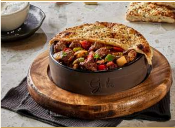
Et Sote - ايت سوتا

Small Cubes of Filetto Meat - Green Pepper - Onion - Garlic - Tomatoes - Black Seed - Dough Cover with Sesame