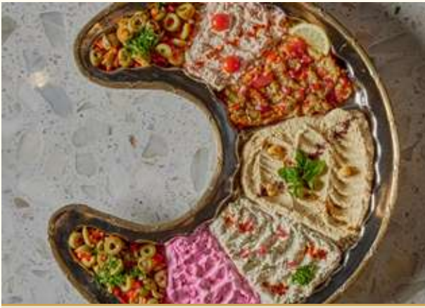
جايپ ميڪس مزه - Gabi Mix Meze

Baba Ganoush - Muttabal - Pepper- Hummus - Beetroot - zeytin salata