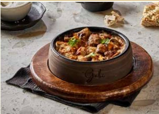
Tavuk Firinda S - طاووق فيرندا صغير

6 Pieces of shish with mushroom and mozzarella cooked in the oven