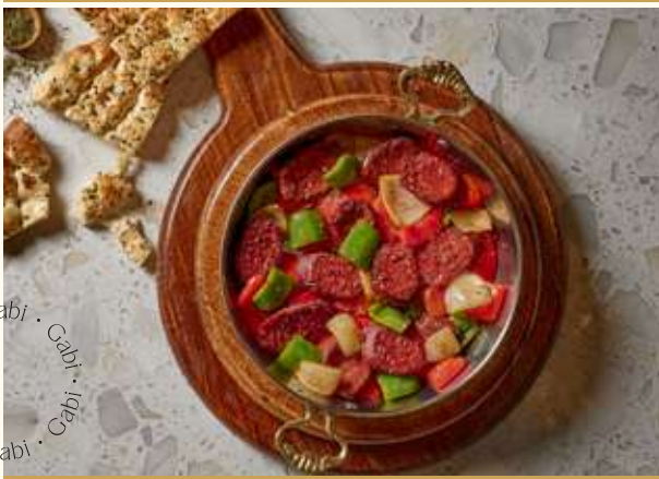
سجق بالخضار - Turkish Sucuk with Vege sausage - tomatoes - red and green bell peppers - white onions