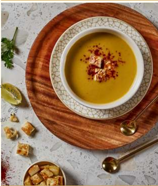
Mercimek Çorbsi - شوربة عدس