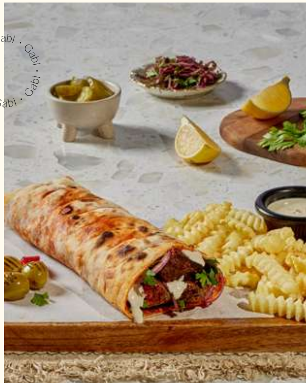
Çiyer Dürüm - سانڊوتش كبد مشويه

Grilled Liver cubes - parsley - onion - tahini