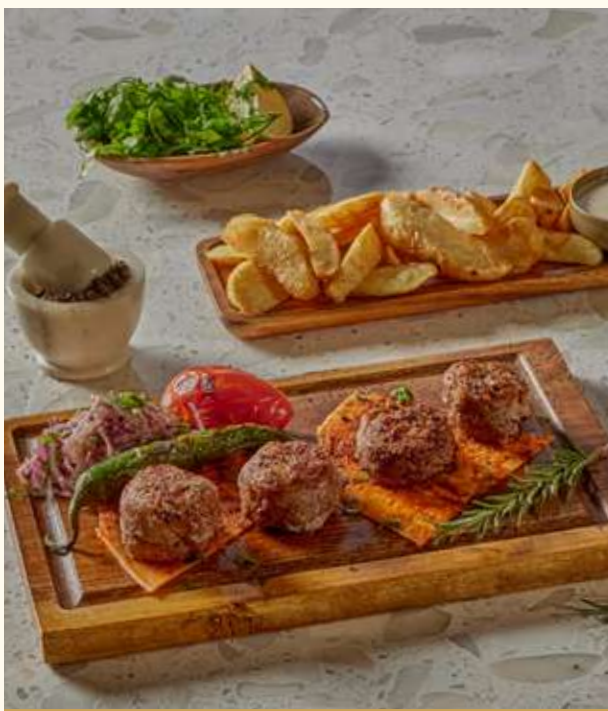
Dana Şarma - لحم فلتو روك محشو بالطرب 5 Pieces of fillet meat stuffed tarb EGP 499