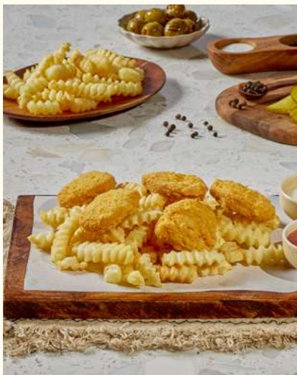
تشكيت ناچتس - Chicken Nuggets

5 piece of chicken nuggets with french fries and ketchup