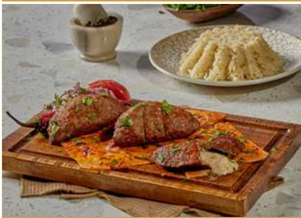
كفتة لحم جبنة - Kofte et Peynirli

3 pieces of kofta filled with mixed cheese with your choice of ( basmati rice - Turkish bulgurl - mixed rice)