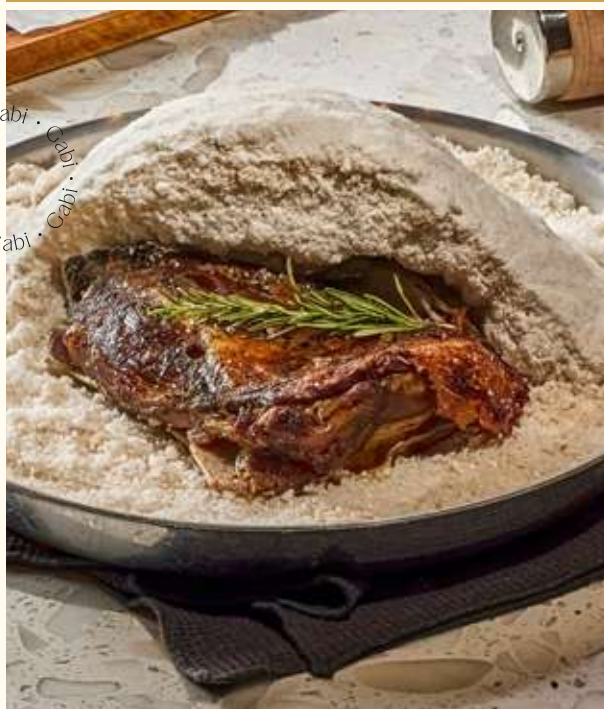
Kuzu omuz tuzda لوح كتف ضاني بالملح