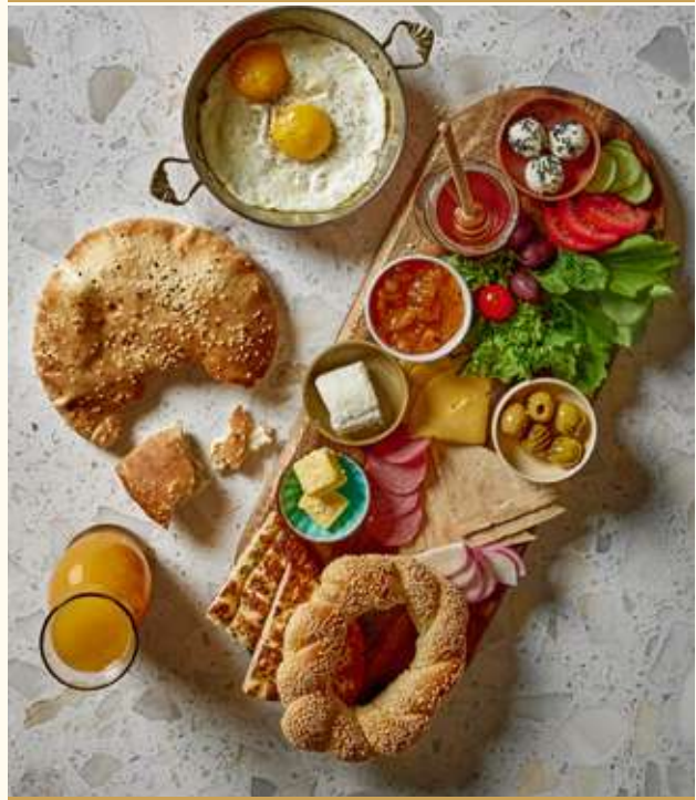
Gabi 1 Person Breakfast فطار جابي شخص