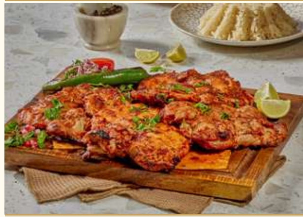
دجاجة مسحب كامله - Kemiksiz Tavuk

Full Chicken with your choice of 2 sides (Basmati Rice - Turkish Bulgurl - Mixed Rice)