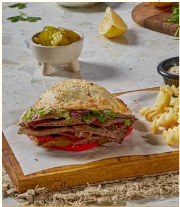
بيبي دؤنر لحم - Baby Döner Et

Döner Meat - Iskander Sauce - Tomatoes - Pickles - Lettuce (Comes with French Fries - Ketchup and Mayo)