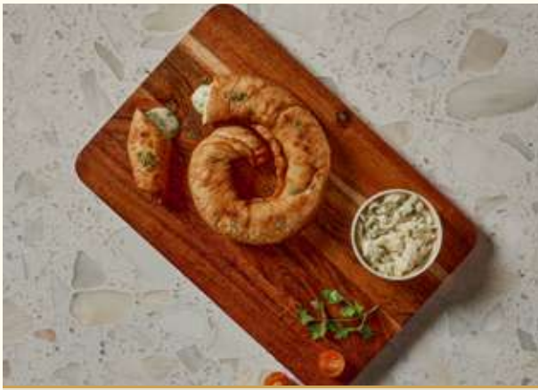
بوریک جبث - Peynirli Borek Fresh Borek dough - Butter - Mix cheese