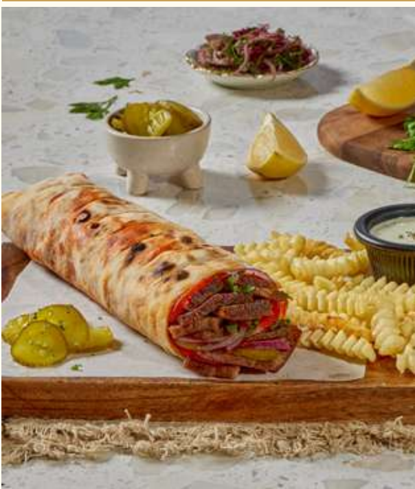
Döner Dürüm - ساندوتش دور لحم

Döner Meat - onion parsley - tomatoes - Pickled Cucumbers- tahini - Iskandar sauce