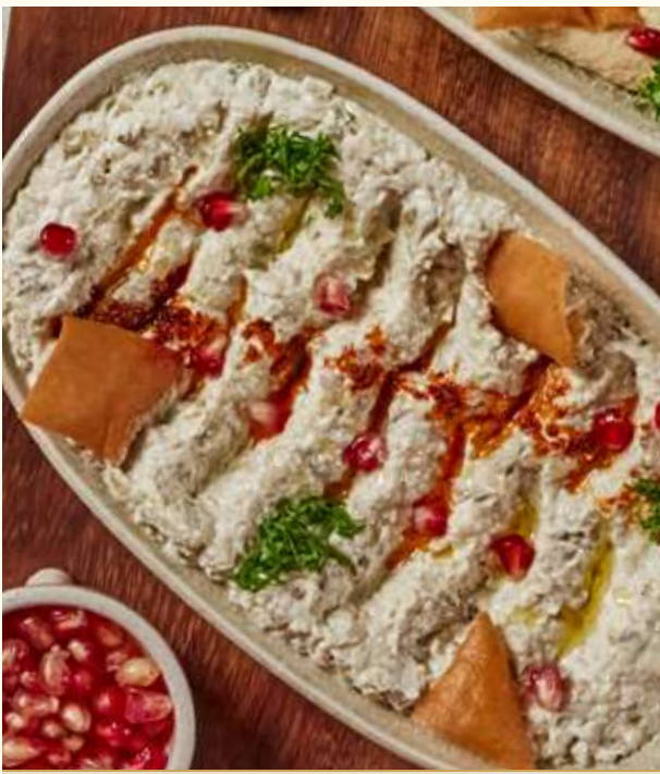
Patlican Yogurtlama - متبل باذنجان

Gabi · Gabi · Gabi · Gabi · Gabi · Gabi · Gabi · Gabi · Gabi · Gabi