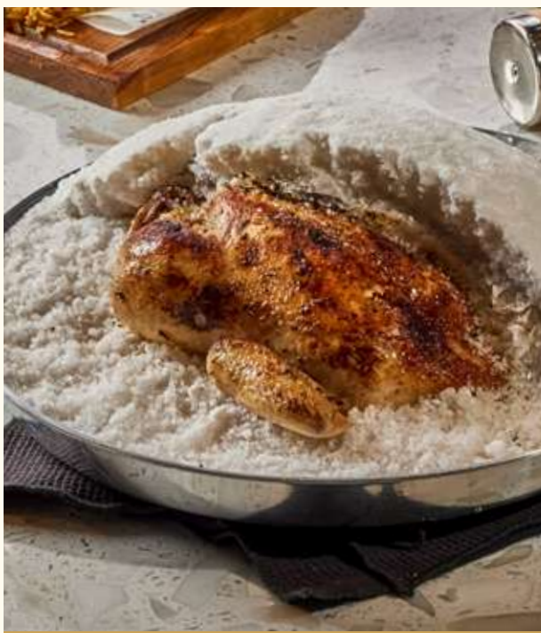
Tuzda Tavuk الحجاجه بالملح