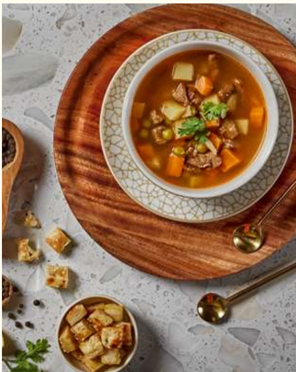
Etli Çorbasi - شوربة لحم بالخضار