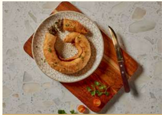
بوریک لحم - Kiymali Borek Fresh borek dough - Butter - Minced beef