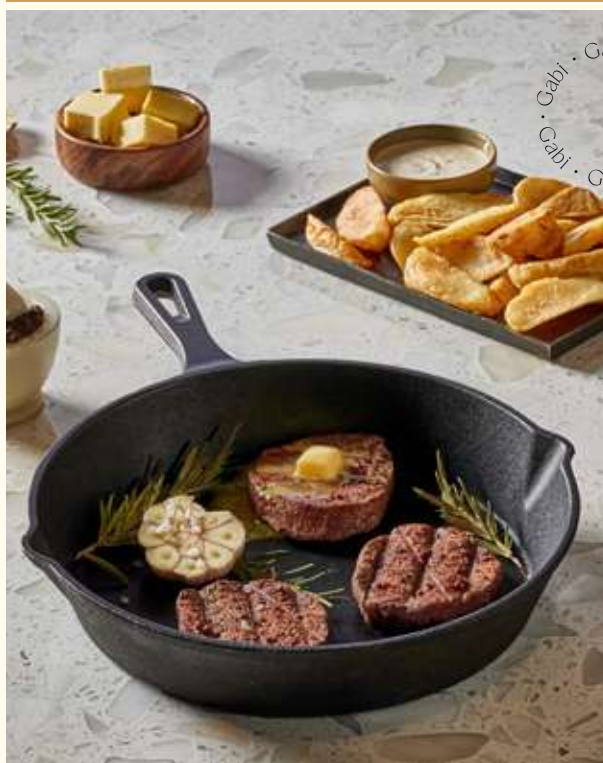
Lokum Et - لحم فلتو مشوي

3 pieces of Fillet Steak Served With Two Sides of Your Choice