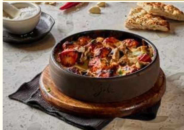
Tavuk Firinda L - طاووق فيرندا كبير

12 pieces of shish with mushroom and mozzarella cooked in the oven