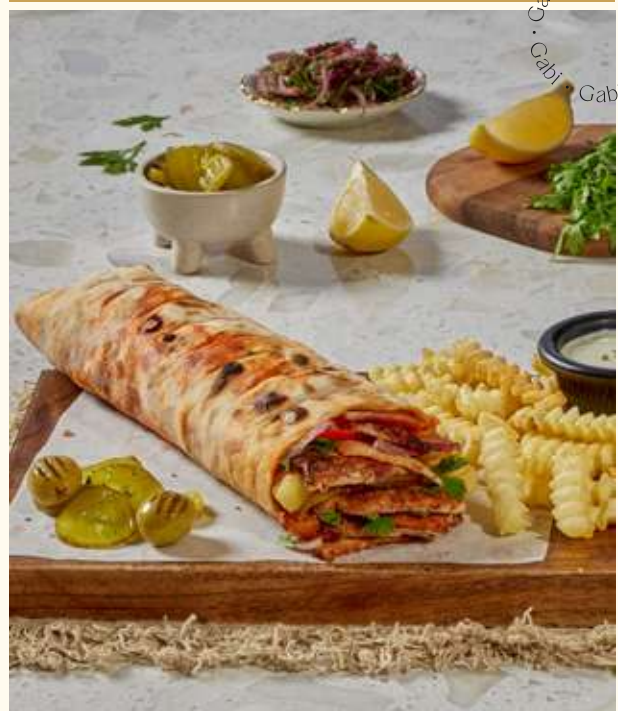
Döner Dürüm Tavuk - ساندوتش دور دجاج

Döner Chicken - tomatoes - Pickled Cucumbers- Mix vegetables - tahini - Iskandar sauce