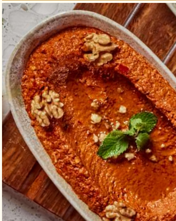
Muhammara - محمرة

Sweet Chilli Pepper - Spicy Chilli Pepper - Spicy Harissa - Rusk - Walnuts