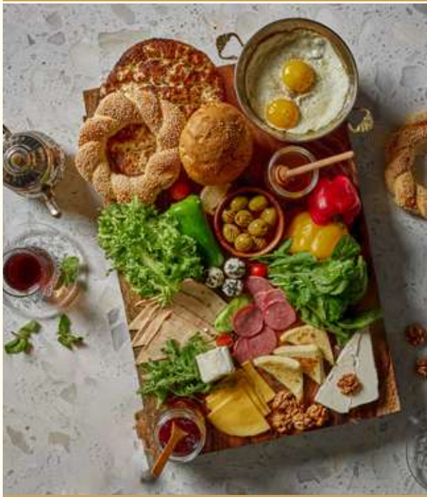
Gabi 2 Persons Breakfast فطار جابي شخصين