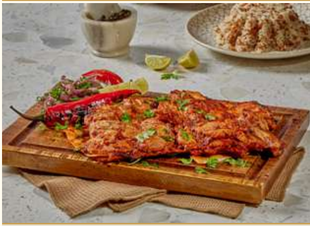
نصف دجاجة مسحب - Yarım Kemiksiz Tavuk

Half Chicken With your Choice of (Basmati Rice - Turkish Bulgurl - Mixed Rice)