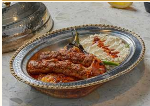
كفتة بادنجان - Patlican Kebab

Meat Kofta Skewer - Grilled Eggplant Your Choice of (Basmati Rice - Turkish Bulgur - Mixed Rice)