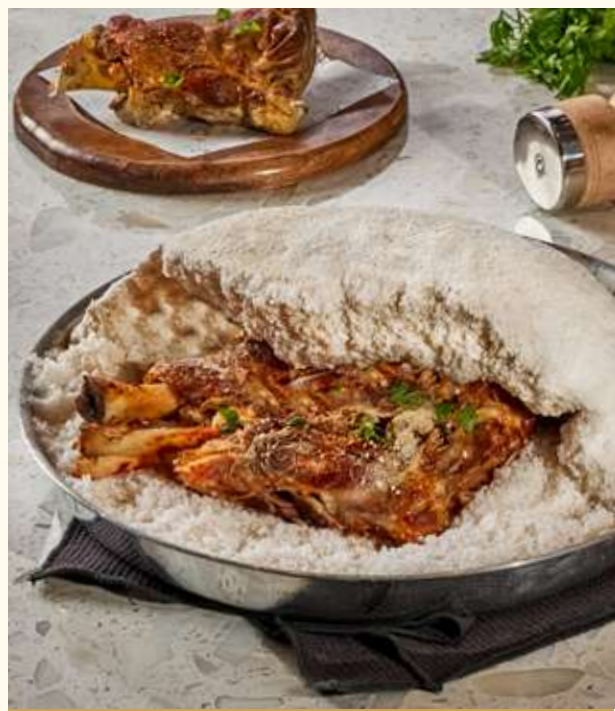
Tuzda Lamb Shank (Moza) 2 Pieces موزة بالملح قطعتين