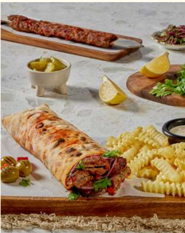
Adana Kebab Dürüm - ساندوتش كفته لحم