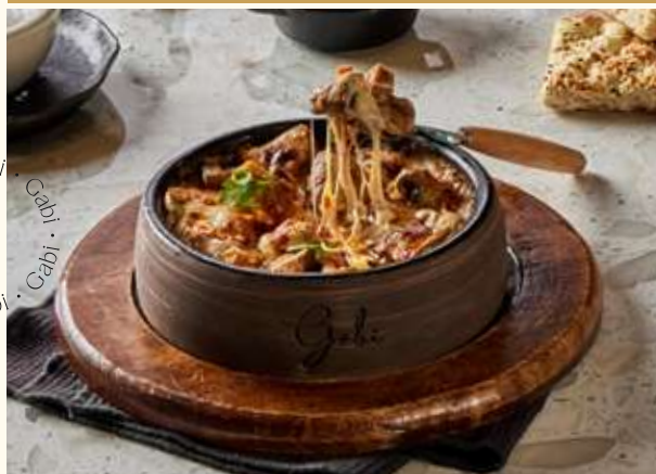
Kasarli Mantar - كشارمنتار

Mushroom with Mozzarella Cheese - Paprika