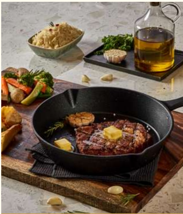
Ribeye Steak ستيك ريب آي

Side ( fries - wedges - sauteed vegetables - rice - mashed potato Add (Groovy Mushroom- Pepper Sauce )= 59 EGP