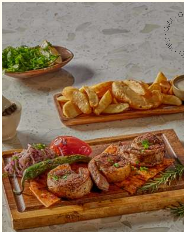
Kuzu Lokum Sarma - بيت كلاوى 3 peices entercote of lamb roll grilled in the turkish way EGP 569