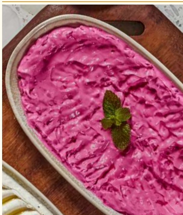
Pancar - بنجر