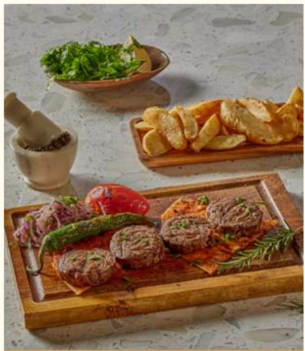
Kebab Roll - كفته لحم ملفوف بلحم فلتو 5 pieces of fillet meat stuffed with kofta meat roll EGP 499