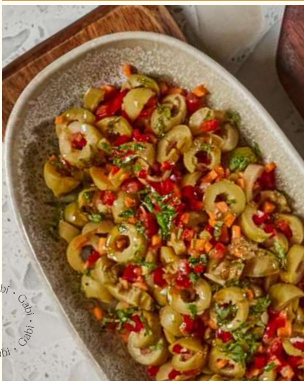
Zeytin Salata - سلطة زيتون

Green Olive Pickles - Carrots - Red Bell Pepper - Tomatoes - garlic