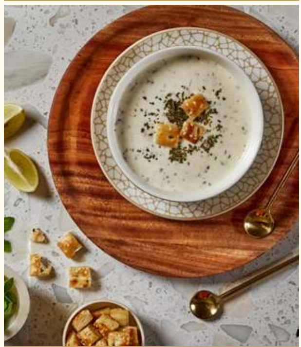
Mushroom cream soup - شوربة مشروم كريمي