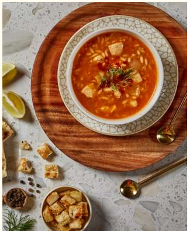
Sehriyeli Tavuk Çorbasi - شوربة شعيرية بالدجاج