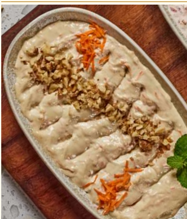
Tarator - تراتور

Tahini - Lemon - Garlic - Labneh - Carrots - Walnuts