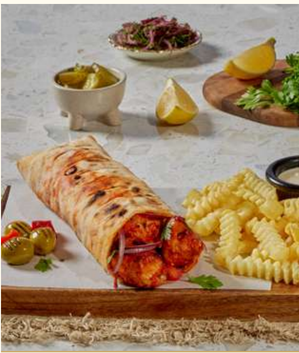
şiş Tavuk Dürüm - سانڊوتش شيش طاووق