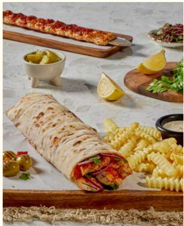
Tavuk Kebab Dürüm - ساندوتش كفته دجاج

Kofta Chicken - Parsley - Onion - Tomatoes