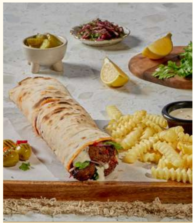
Kuşbaşı Dürüm - سانڊوتش شيش طاووق