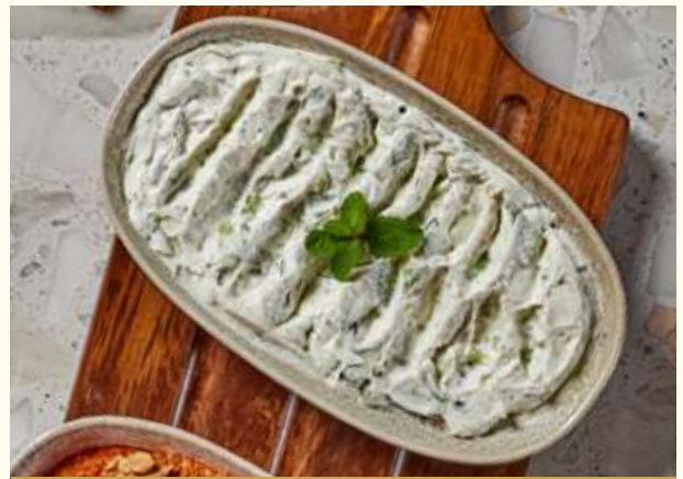
جاجيڪ - Cacik