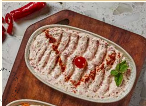
زبادي جار - Biber Yogurtlama