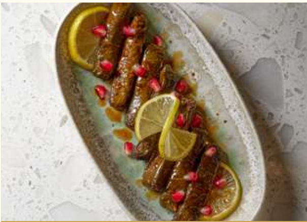
ورق عنب - Yaprak Sarma

7 pieces of Vine Leaves - Pomegranate Molasses