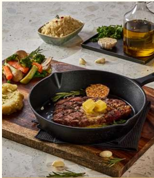
Stiplion Steak ستربليون ستيك