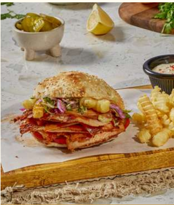
بيبي تشكيت دؤنر - Baby Döner Tavuk

Döner Chicken - Iskander Sauce - Tomatoes - Pickles - Lettuce (Comes with French Fries - Ketchup and Mayo)