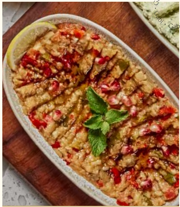
Babagannuc - بابا غنوج

Eggplant - Bell Pepper - Tomatoes - garlic