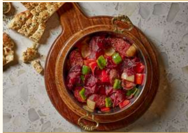
سجق وبسطرمة بالخضار - Sucuk & Pastrami with Vege pastrami - tomatoes - red and green bell peppers - white onions