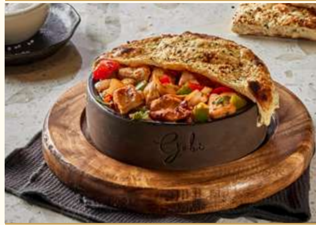
Tavuk Sote - طاووق سوتا

Small Cubes of Chicken Cubes - Green Pepper - Onion - Garlic - Tomatoes - Black Seed - Dough Cover with Sesame