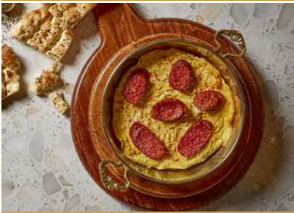
بیض سجق - Omelette Sucuk Egg - butter - sausage