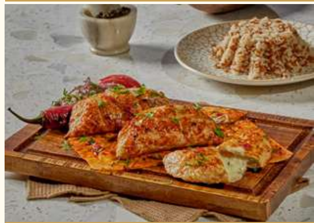
كفتة دجاج جبنة - Kofte Tavuk Peynirli

3 pieces of chicken kofta filled with mixed cheese with your choice of ( basmati rice - Turkish bulgurl - mixed rice)