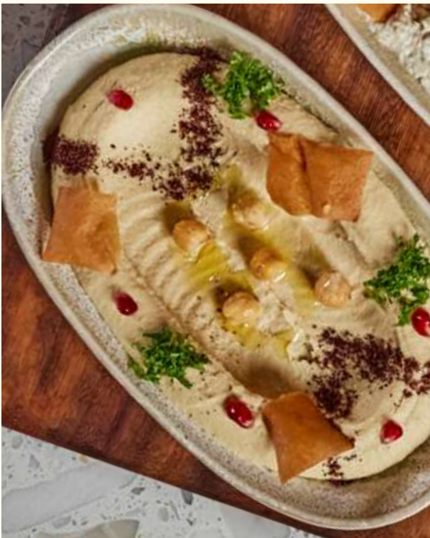
Humus - حمص