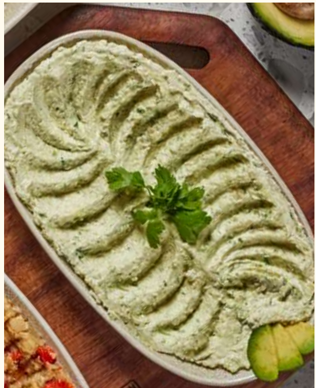
Avokado Yogurtlama - أفوكادو لبننة